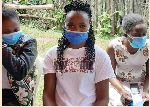
Our partners in Kenya participate in Covid-19 Training

their loans, and the group revolving loan funds were lost. RSWR responded to this unprecedented situation by allowing groups to apply for a second funding.