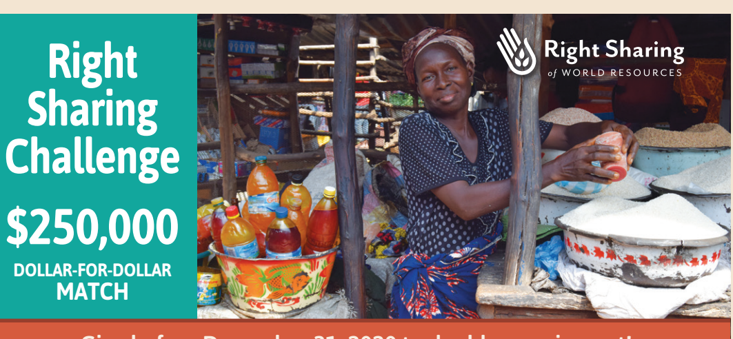
Give before December 31, 2020 to double your impact! Make a gift today at rswr.org/donate

The first year of the Challenge Match welcomed 184 new donors into the Right Sharing family. The additional contributions of $193,092 provided increased support for overseas Programs and urgently needed Food Aid.