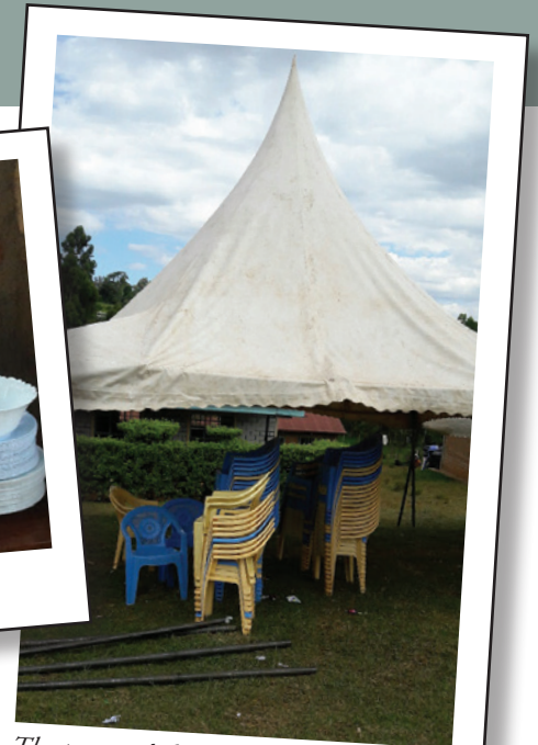
The tent and chairs the Jitahidi Self Help Group uses for their catering business