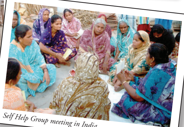
Self Help Group meeting in India