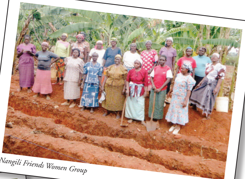
Nangili Friends Women Group