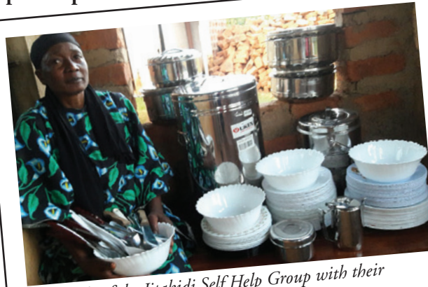
Chairlady of the Jitahidi Self Help Group with their catering supplies

In 2015, a RSWR partner was sexually assaulted. Crimes such as this against women often go unpunished in India; indeed, even though the woman pressed charges, the police refused to arrest the man. The other women in her self-help group supported her and organized 80 women to demonstrate outside the police station. The local press took notice and began covering the story, so the police were forced to arrest the man. It eventually became national news and brought the issue to everyone's attention.