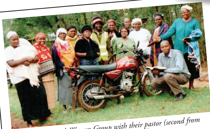
The Shikulu Friends Women Group with their pastor (second from right) and the motorbike their group purchased