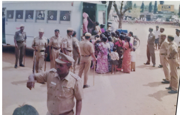
Women in India arrested for protesting