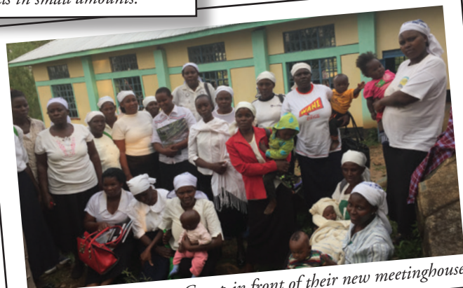
Sigira Friends Women Group in front of their new meetinghouse.