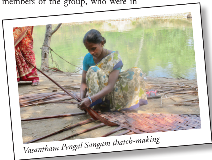
Vasantham Pengal Sangam thatch-making

good spirits, related how much their incomes had increased since they had become independent of an employer. The visitors also spent time with a group making coir rope, which uses dried coconut husks and a machine that takes four women to operate.