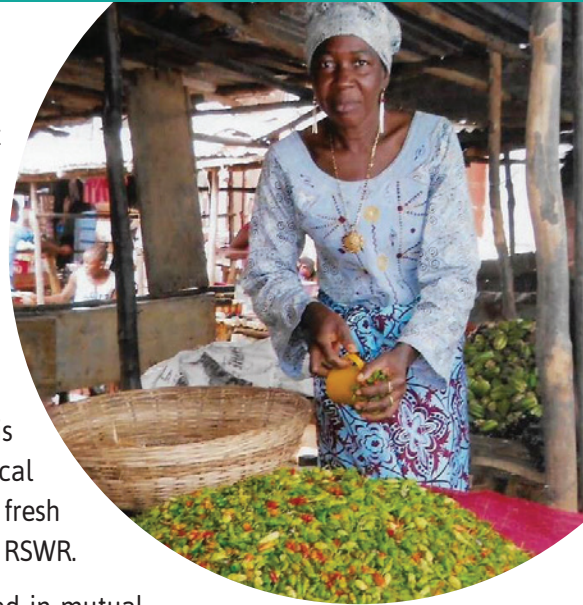
A member of Lumpa 555 Women Association at her pepper stall in the local market. The group in the Western Rural District of Sierra Leone was approved for funding in Fall 2017.

"LET US THEN SEE WHAT LOVE CAN DO." – William Penn, 17th Century Quaker