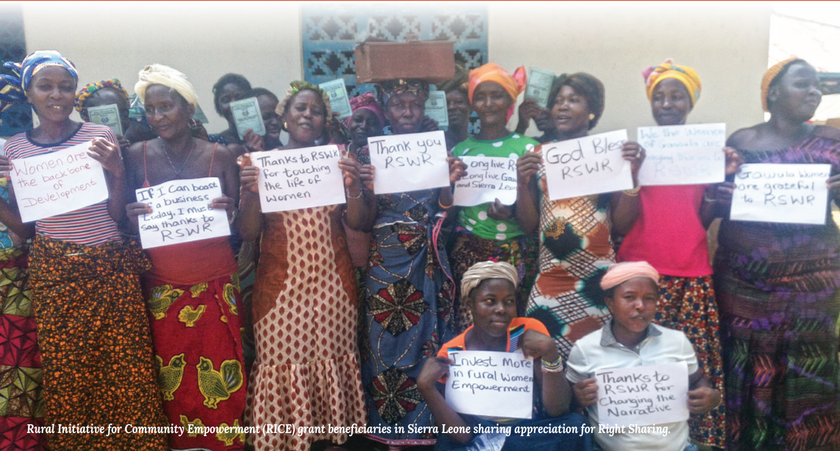
Rural Initiative for Community Empowerment (RICE) grant beneficiaries in Sierra Leone sharing appreciation for Right Sharing.

Missed the match in 2019? Donors who renew or increase their giving in 2020 will be matched in 2020 and 2021!