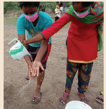
COVID trainings included hand-washing techniques.

2 The first international RSWR Field Representative Consultation was held in Indianapolis, IN in conjunction with the RSWR fall board meeting. Field Reps and Trainers formed lasting bonds with each other, US staff and board members. They shared best practices and challenges in each of their country's programs, and considered the future of RSWR. Afterwards they traveled throughout the US visiting with Friends Meetings and partners.