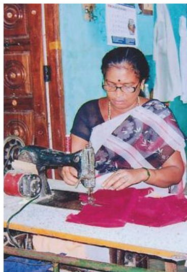
A woman from the Dr. Gordon Memorial Trust project tailoring.

started businesses including making Indian drums, tailoring, and making and selling jewelry, among others. Although the women were initially fearful of being cheated and concerned about making enough profit, the NGO staff visited often and supported the women in buying goods and sharing success stories among themselves. By the end of the first year, the women's self-confidence was greatly increased, they were making a significant income, and they were able to provide their children with good food and education fees.