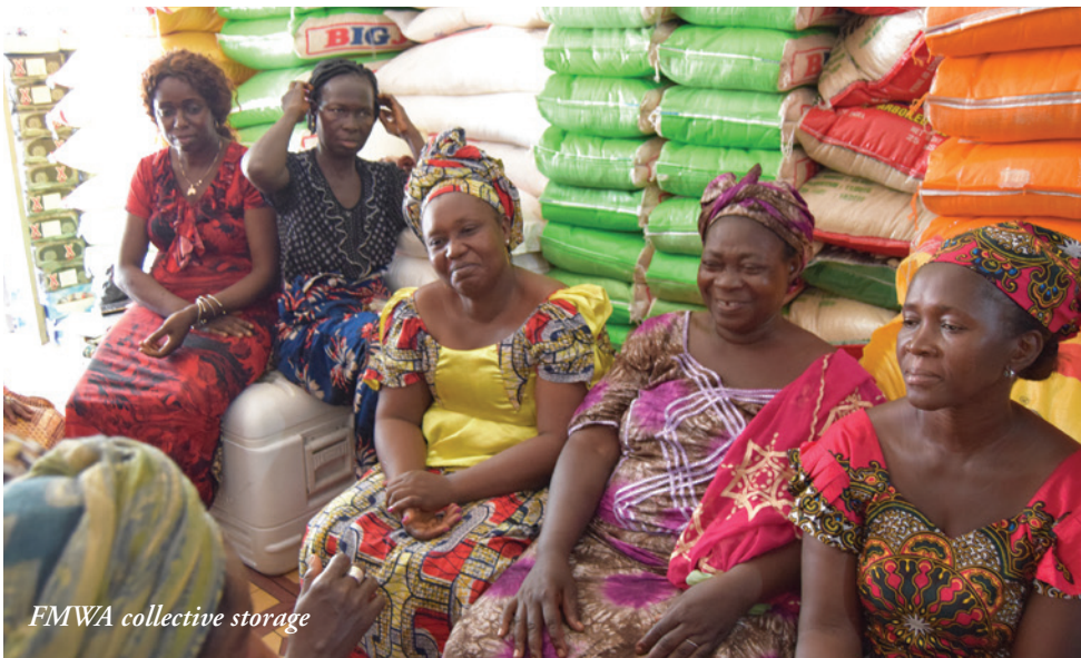
FMWA collective storage