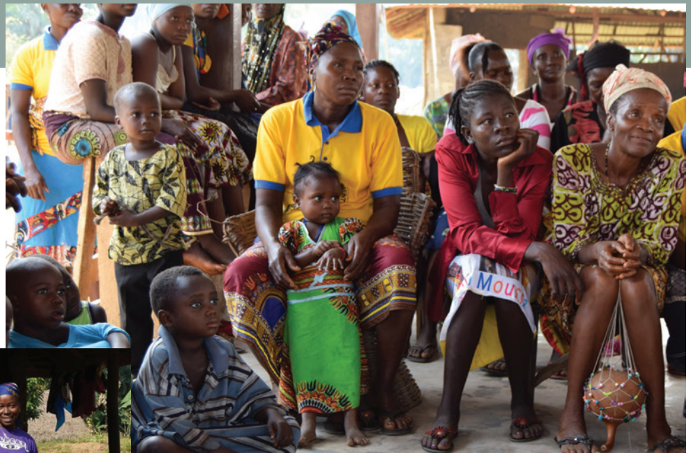
Beneficiaries and children TCDO

From May 2014 until March 2016, Sierra Leone went through an Ebola epidemic that resulted in almost 4,000 deaths. The country experienced an almost two-year quarantine involving school and business closures to try to contain the illness. Crops failed when agricultural workers were quarantined and kept from their land. The country has been working hard to recover from the effects of the epidemic and quarantine in order to find solid footing again.