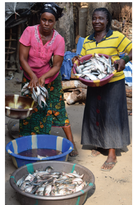
Women preparing fish for smoking