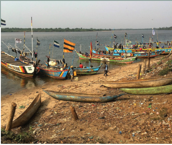
Fishing boats GCDF

to great use in the village. The women purchase fish, which they then smoke and sell at markets. The women have more than doubled their income since receiving the grant. There has been such success that the NGO has been inundated with requests for help from women in nearby areas! The NGO recently received a second RSWR grant to expand its assistance to a group of women in a nearby village.