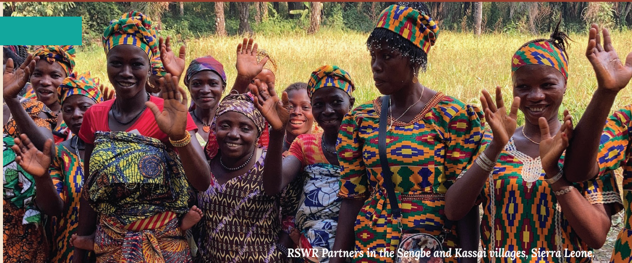
RSWR Partners in the Sengbe and Kassai villages, Sierra Leone