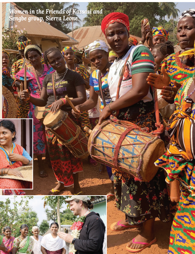
Women in the Friends of Kassasi and Sengbe group, Sierra Leone