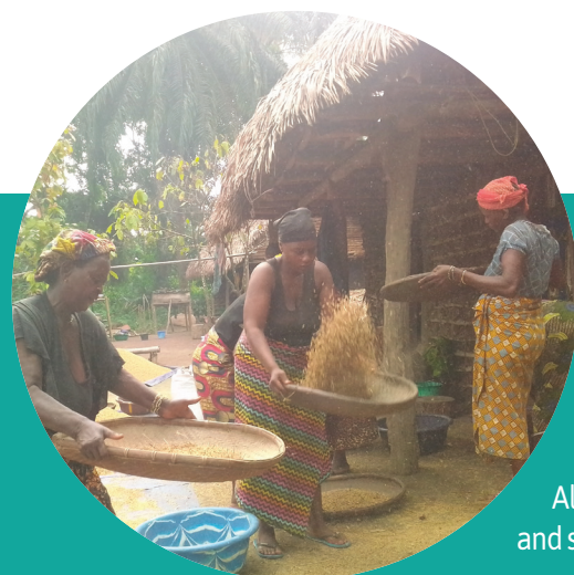
Rice harvest in Sierra Leone

TOTAL LIABILITIES AND NET ASSETS $ 2,820,189