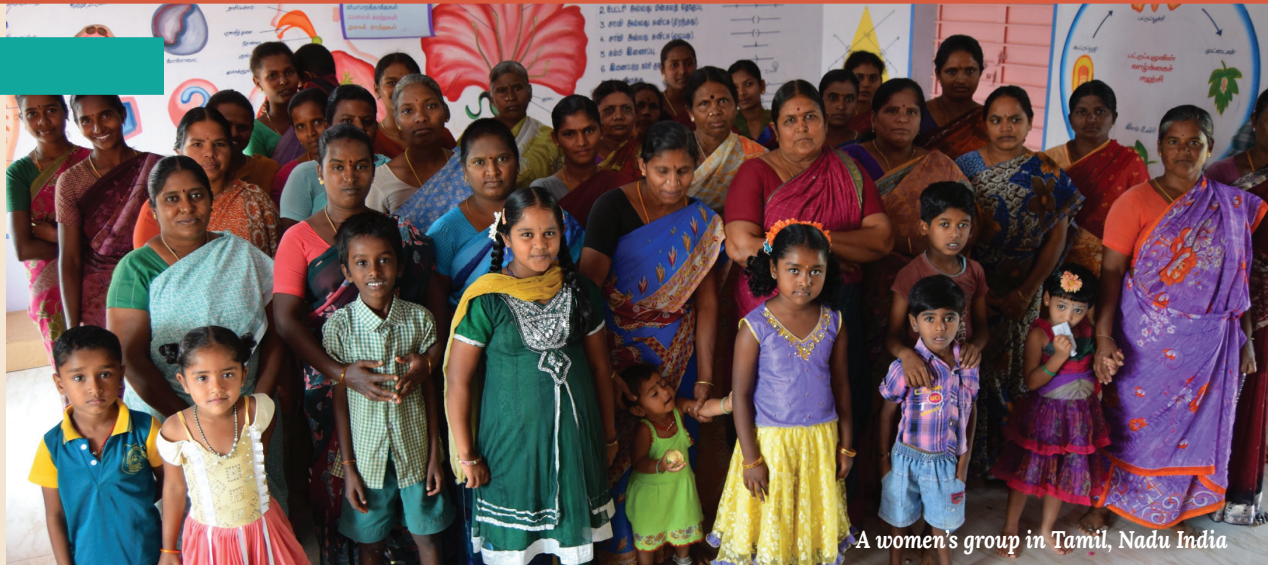
A women's group in Tamil, Nadu India