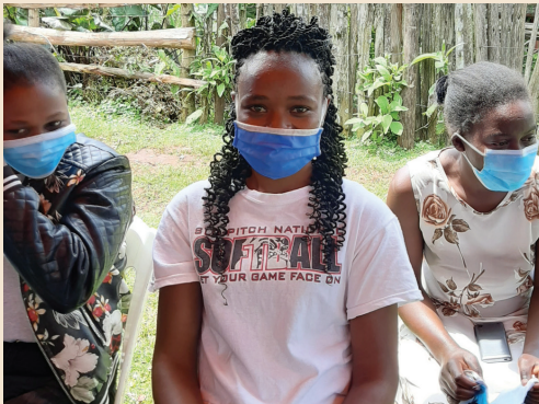
Our partners in Kenya participate in Covid-19 Training

3 RSWR food aid was sent to India in July 2021 , when the country was experiencing its second wave of Covid cases. It was used to support 3000 women.