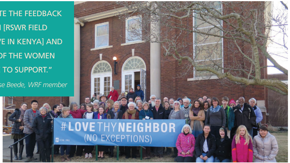
West Richmond Friends outside their meetinghouse.